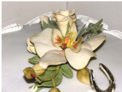
Sugar flowers on a wedding cake

Ring 01326 280074 with orders for the following day.