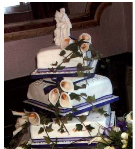
Cakes are a speciality