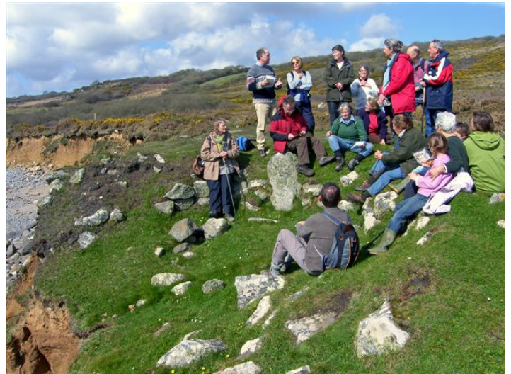
Salt Walk, Lowland Point