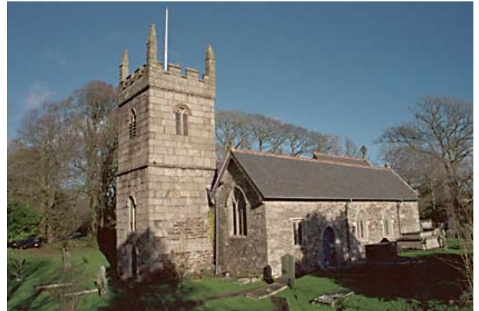
Church of St Mawnan, a grade II Listed Building